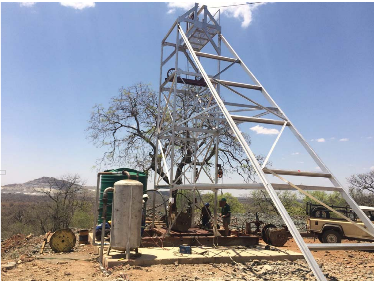
Figure 1: Prestwood Gold Mine headframe and infrastructure