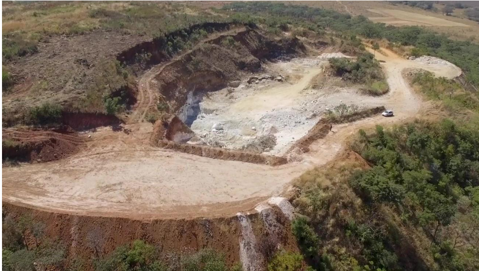
Figure 2 – Arcadia open pit being utilised for the pilot plant

Operating the pilot plant has allowed for substantial operational learnings from blast and haul techniques (Figure 2) through to material handling to minimise contamination and increase productivity. Technical learnings have been derived from a broad adaptation of the operating conditions, allowing the team to characterise metallurgical behaviour across permutations of plant operating conditions.