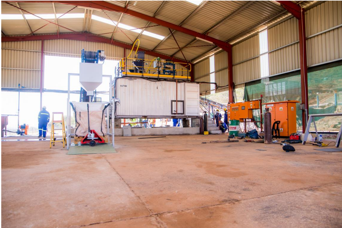
Figure 1 – Dense Media Separation (DMS) unit

On 25 June 2021, Prospect announced the completion of construction and commissioning, and the commencement of production, at the Arcadia Pilot Plant. The construction and operation of the Pilot Plant is purposed to the production of high purity petalite concentrate samples for Prospect's long-term technical petalite customer base.